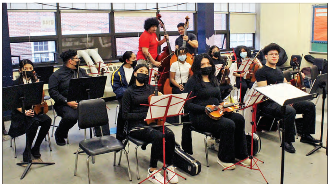
Orchestra rehearsing for Spring concert.

The spotlight was then hand- Continued on Page 6