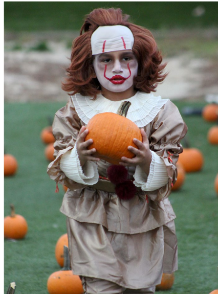
In addition to giving out candy, a pumpkin patch was created for the perfect Jack-o-lantern.