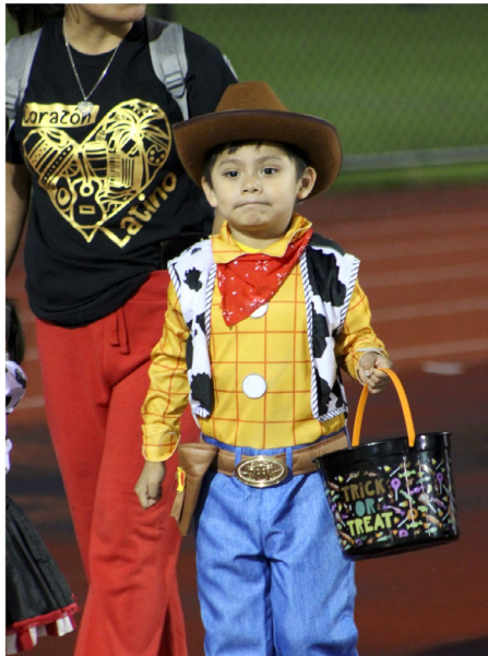
Woody enjoys getting his candy basket filled at Track or Treat day.

Looking at the photos included here, the joy that kids and their families shared is obvious. What is not as obvious is that the students from PHS had just as much fun. This is a great event that should be repeated next year. Good job everyone!