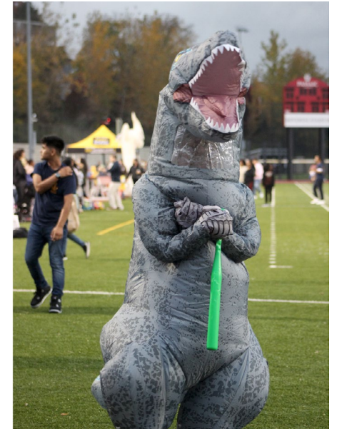
Bet no one has ever seen a baseball-playing T-Rex.