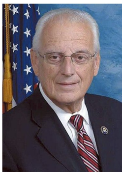
Congressman Bill Pascrell (NJ-9th District)

After graduating high school in 1955, he enlisted in the United States Army Reserves, serving from 1955 to 1967, achieving the rank of a Sergeant (E-5). Pascrell attended Fordham University in Bronx, New York. He earned a bachelor of arts degree in journalism, and then a master of arts degree in philosophy. After college, Pascrell became a psychology high school teacher in Paramus, New Jersey. Then, he became a college professor at Fairleigh Dickinson University. He decided to run