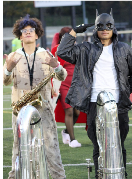
Marching Band members pause from fighting crime in Gotham and (taking a nap as Groggu?) to entertain the kids.