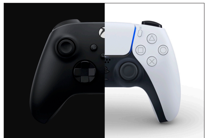
Playstation's controller is new and the Xbox controller is an upgrade.

The winner of this battle depends on what the purchaser wants to get out of this machine. If you want to have a gaming console which almost has the same capabilities as a gaming PC, then you'll want to go with the PlayStation 5 as it will allow you to play games that you would not play on a non-gaming PC. However, if you're looking for loads of games to play for more entertainment and without spending a lot of money, then the Xbox Series X/S is the console for you. For this reviewer, more games, right now, means more fun, so look for the upcoming review of the new Xbox console in the next issue!