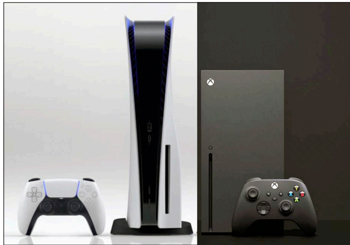
Playstation or Xbox? That is the question.

The processing and video power of these consoles is the biggest selling point and major upgrade for these two systems. The Xbox Series X/S has a slight advantage on this front with 18% more processing power than the PlayStation 5, although some people at Digital Foundry had tested the