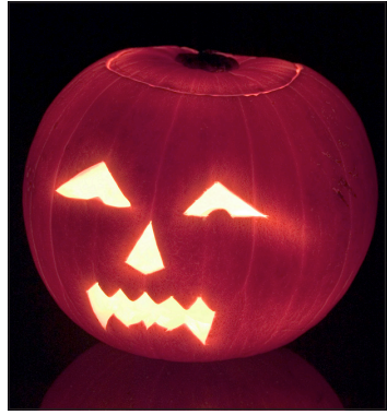
Pumpkin carving is a safe activity to do for Halloween, during the COVID pandemic.

In the fall, health officials expected a new increase in COVID-19 cases as temperatures dropped and the flu season approached. The CDC advised