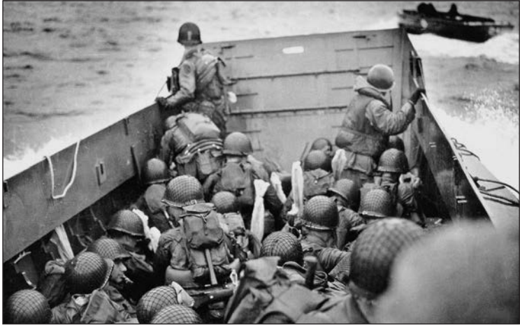
Soldiers crossing the English Channel on the way to D-Day invasion.