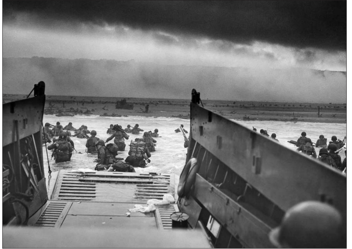
Men of the 16th Infantry Regiment, US 1st Infantry Division, wading ashore on Omaha Beach on the morning of June 6, 1944.

warming and that's a lesson we shouldn't forget. We should always be willing to help the others despite the circumstances