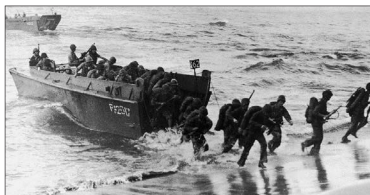
Soldiers hitting the beach on D-Day.

This is the invasion that saved the lives of Europeans from German control. This event makes us remember the past, the harsh reality that they had to endure before. It is very saddening indeed but the D-Day gives us the idea that with great planning you'll be able to be successful. Also the fact that people risked their lives to save others is very heart-