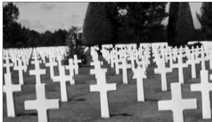
Graveyard in Normandy, France.

I think it should always be remembered because it was a war that thousands and thousands of soldiers that