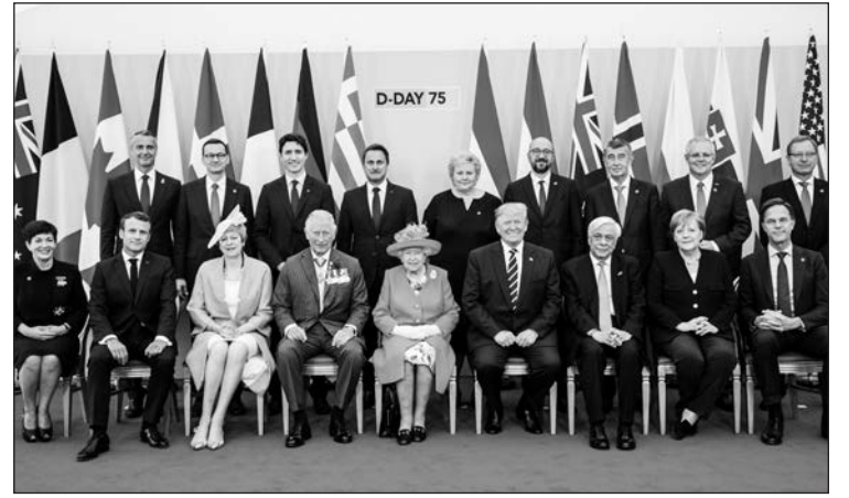
World leaders, including President Donald Trump and England's Queen Elizabeth, gather in Portsmouth, England to commemorate the 75th anniversary of D-Day.

D-Day was the largest amphibious invasion in military history. With over one hundred and fifty thousand troops, almost seven thousand ships and twenty-four hundred aircraft, this was a massive organizational nightmare. The fact that all these