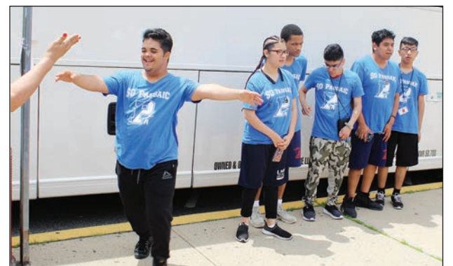
Congratulations to these hard-working Indians, as they represent PHS in the Special Olympics.