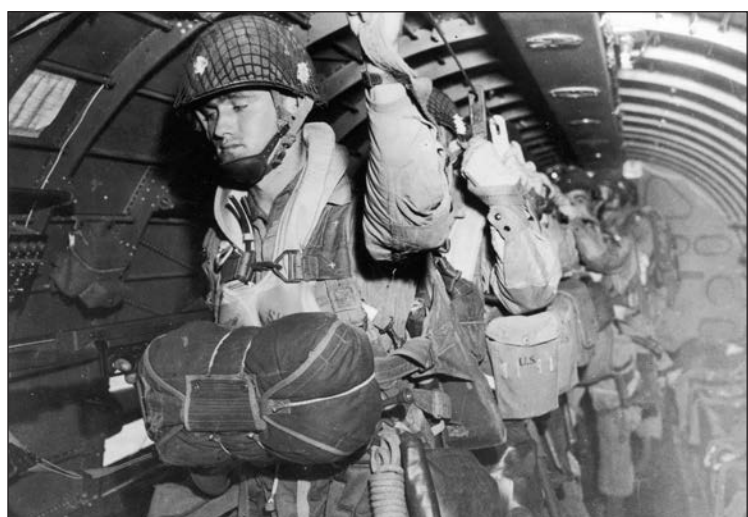
U.S. paratroopers prepare to jump prior to invasion.

In my opinion, I think D-Day should be remembered because it had a big impact in America. The "Operation Overlord" campaign was launched and Their