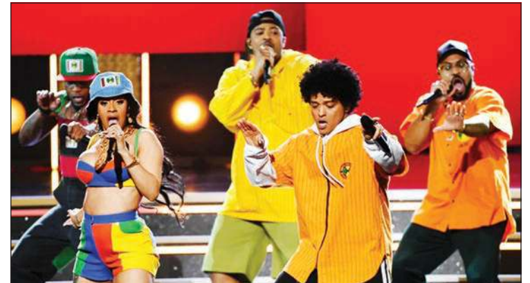
Only 24 Karat Gold for Bruno: Bruno really did have an incredible night! After an incredible performance, the singer won all six of the Grammys he was nominated for, including the coveted Album of the Year. Bruno also won R&B Album, Record Of The Year for "24K Magic," Best R&B Performance, Best R&B Song and Song Of The Year for "That's What I Like."