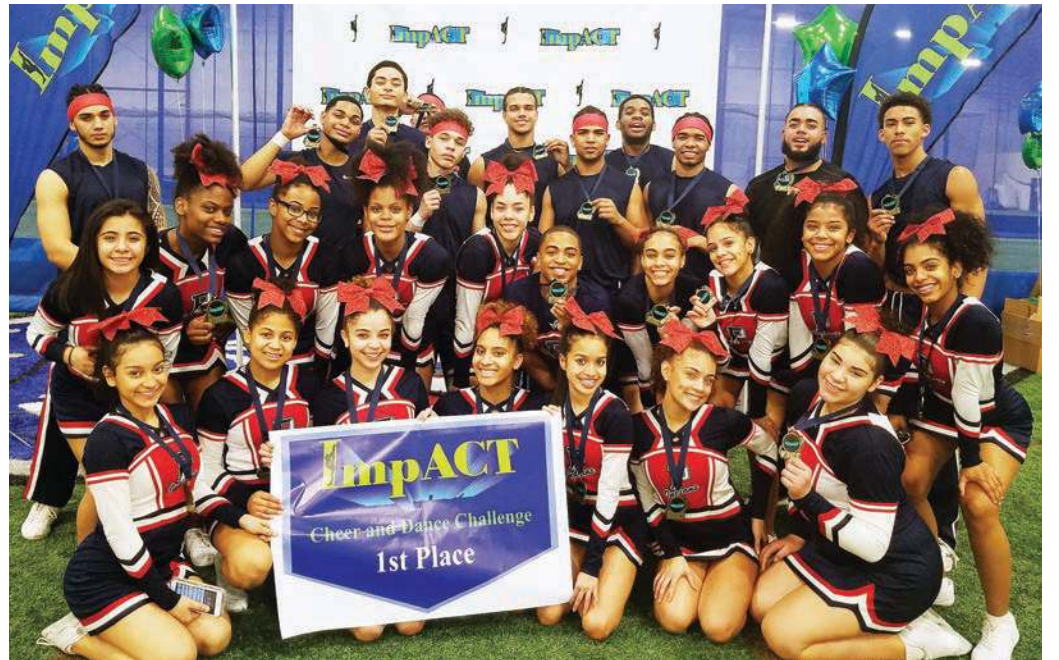
PHS Cheerleaders won first place at the Impact Cheer Challenge.