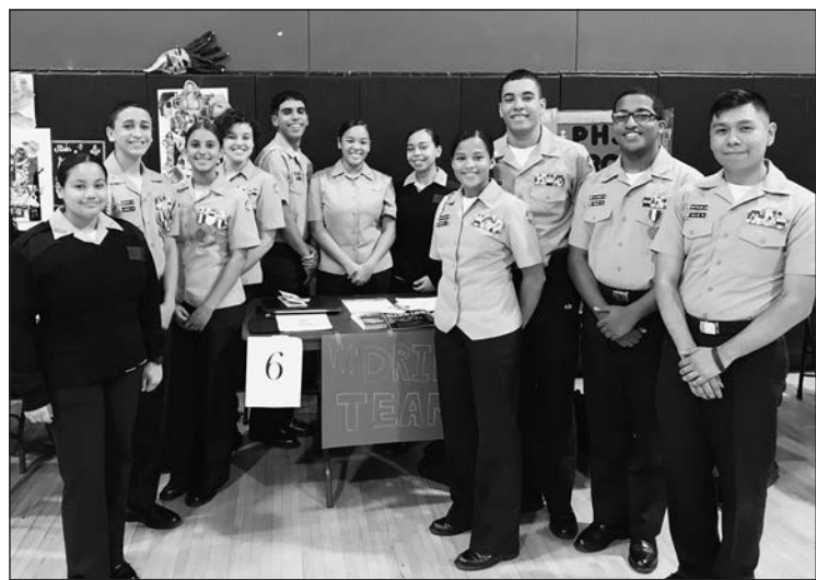
Drill Team at the Club Fair.