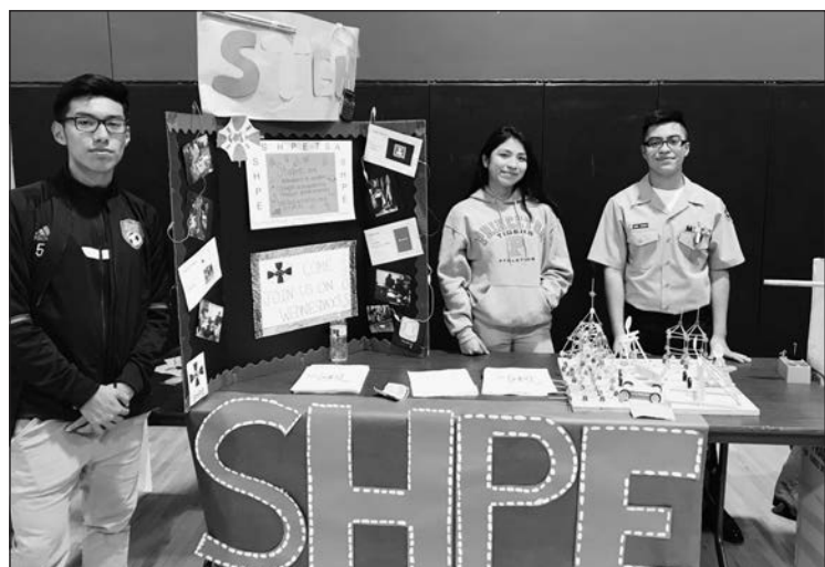
Society of Hispanic Professional Engineers (SHPE)