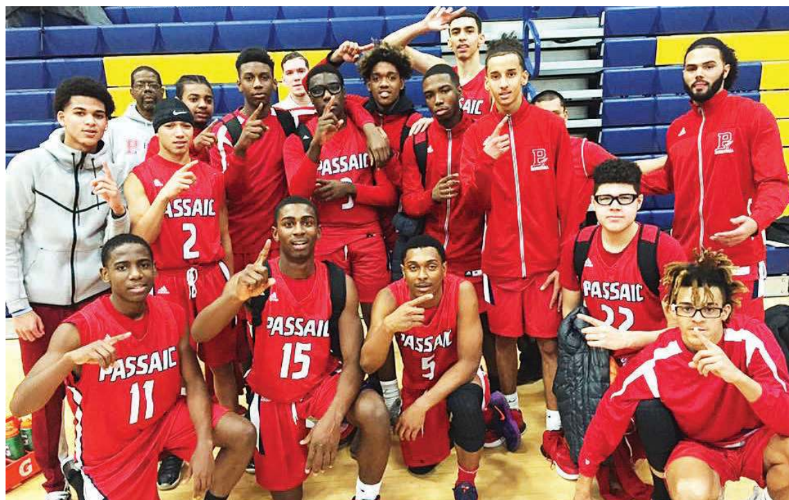
The PHS Boys Basketball team won the majority of their games this season, with a record of 11-10 as of February 26. The boys have improved by winning six more games this season.