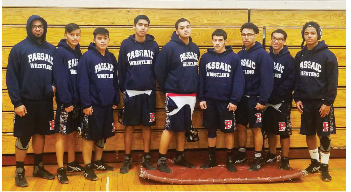
PHS Wrestling team