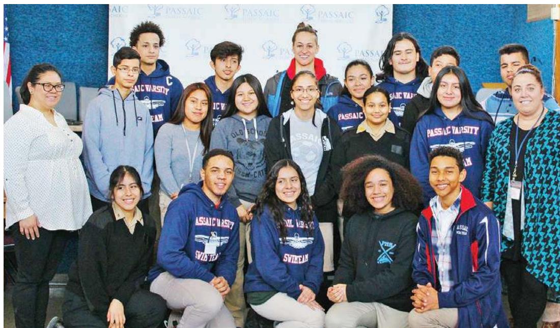
PHS Swim team