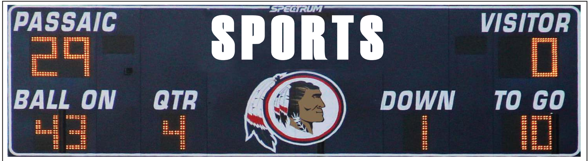
Memorable view of the PHS Stadium scoreboard showing the final score between Passaic and Clifton.