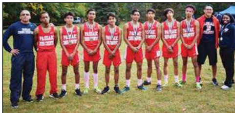
Cross Country Boys