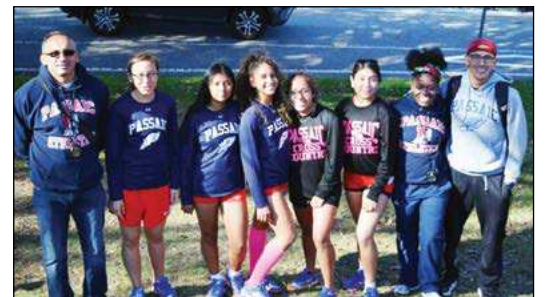
Cross Country Girls

Great job to our student athletes this year. You have made PHS proud!