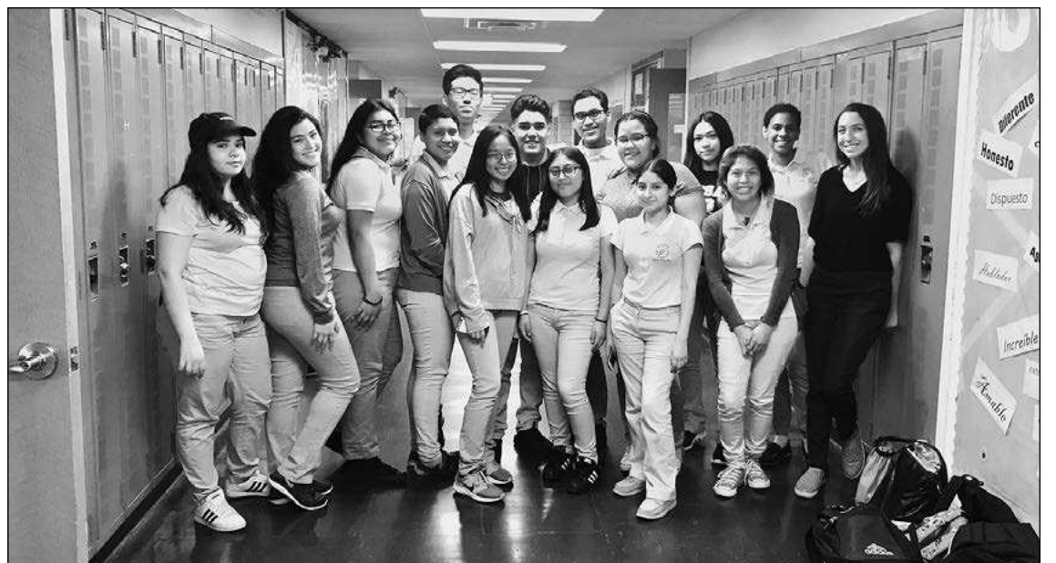
The Hilltop Star Newspaper Club would like to thank everyone who has contributed to this year's issues and helped us out. We could not have done it without you! See you in September!

Layout and Printing by Media Trends LLC 732-548-7088