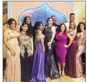
Senior Prom See page 6.